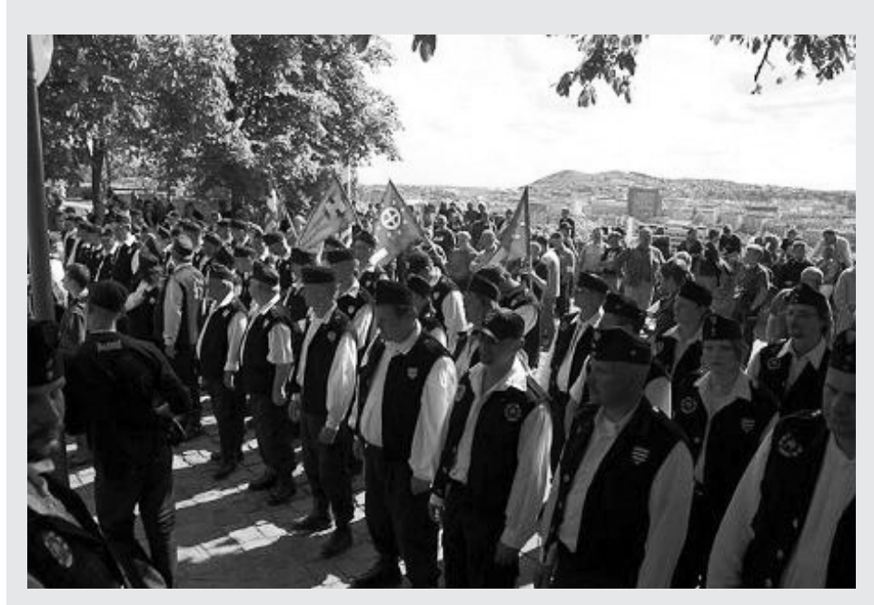
Ready for action: paramilitaries of Jobbik's now-banned Hungarian Guard

"people" (while the press, which is in the hands of those in power, hushes up such conspiracies) can easily take off.